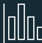
FIGURA ANALYSIS AND TESTING (FAST)

Interested in using our technology for one of your applications?