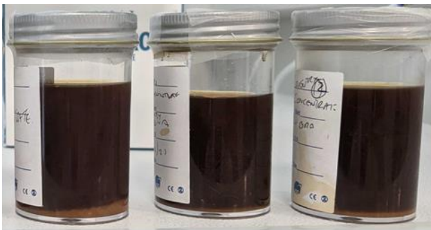
Figure 1: Syrup-based soft drink samples from three different worldwide distribution locations.

Figura Analytics novel particle characterisation and counting technology, the Figura Analyser™, was utilised to looking at real-world samples supplied by a large soft drinks manufacturer (Figure 1). The company wanted to gain information on their products and see if they could particle profile samples at different distribution points.